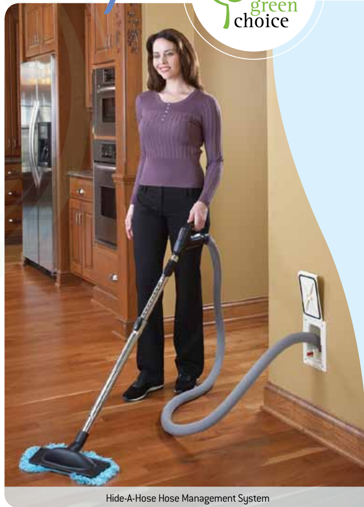
Hide-A-Hose Hose Management System