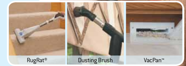
RugRat® Dusting Brush VacPan™