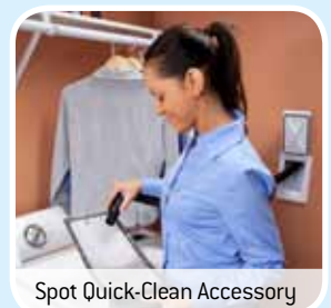
Spot Quick-Clean Accessory